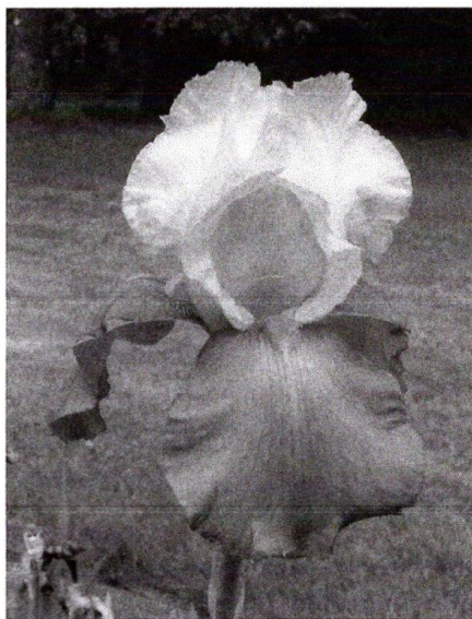
'Adobe Rose' (Ernst, 1988)